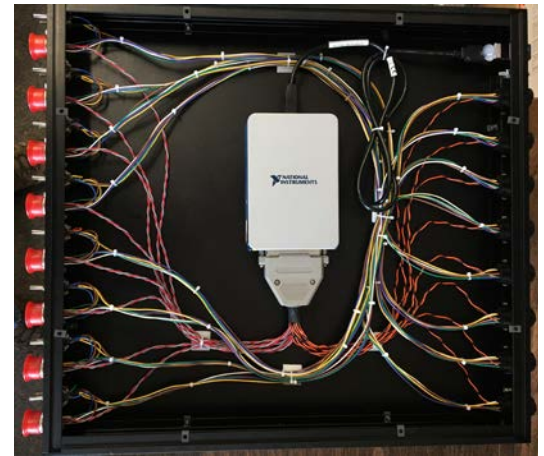
Inside strain gauge assembly with Precision Filter low-pass filtering module.