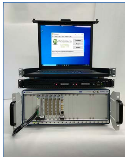
Rack-mounted monitor server with RAID & NI PXI chassis.